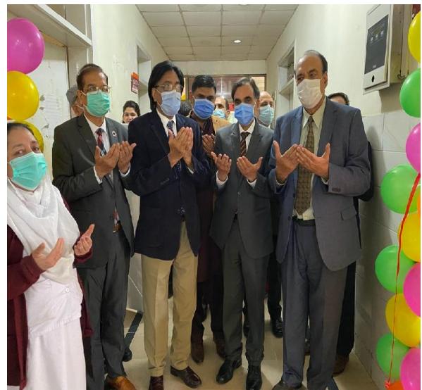
Inauguration Ceremony of Child Protection Unit