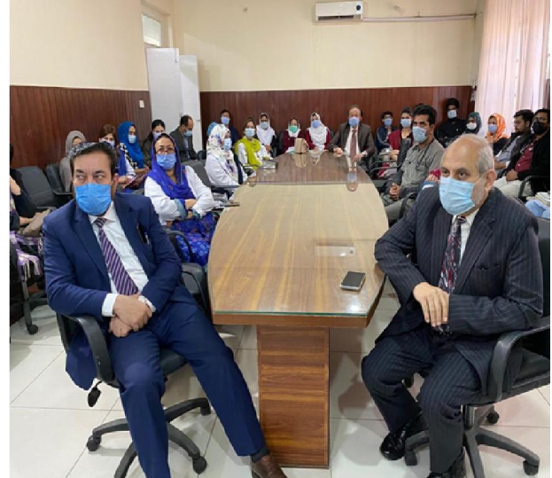
Launching Ceremony of Child Rights Module in MD & DCH Curriculum Inauguration