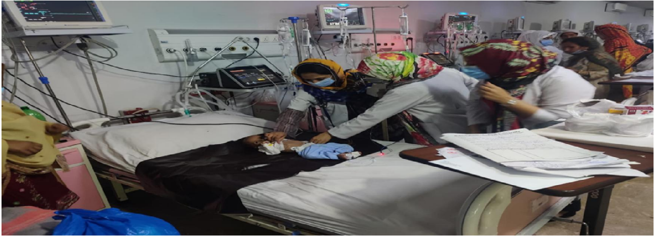
Few Cases seen in Child Protection Unit