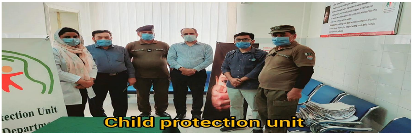
Few Cases seen in Child Protection Unit