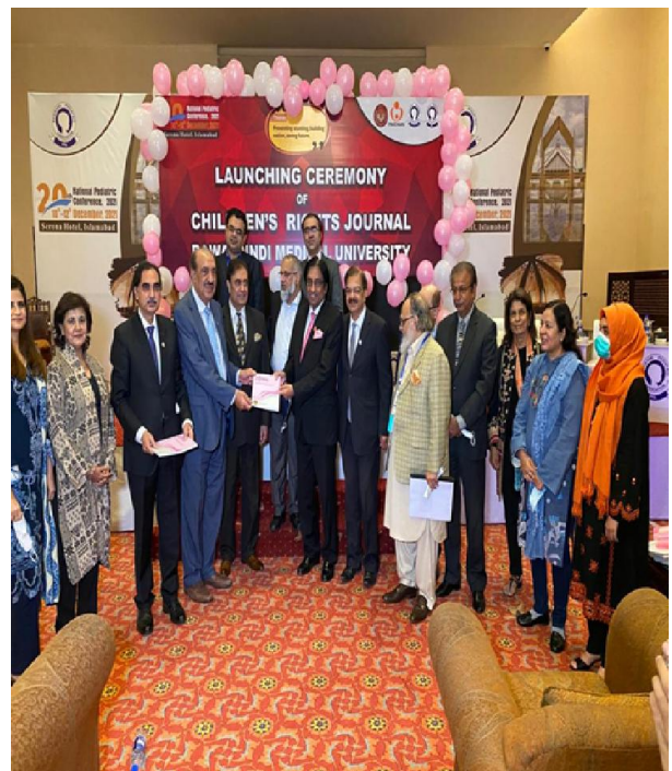
Launching Ceremony of Children Rights Journal of Rawalpindi Medical University